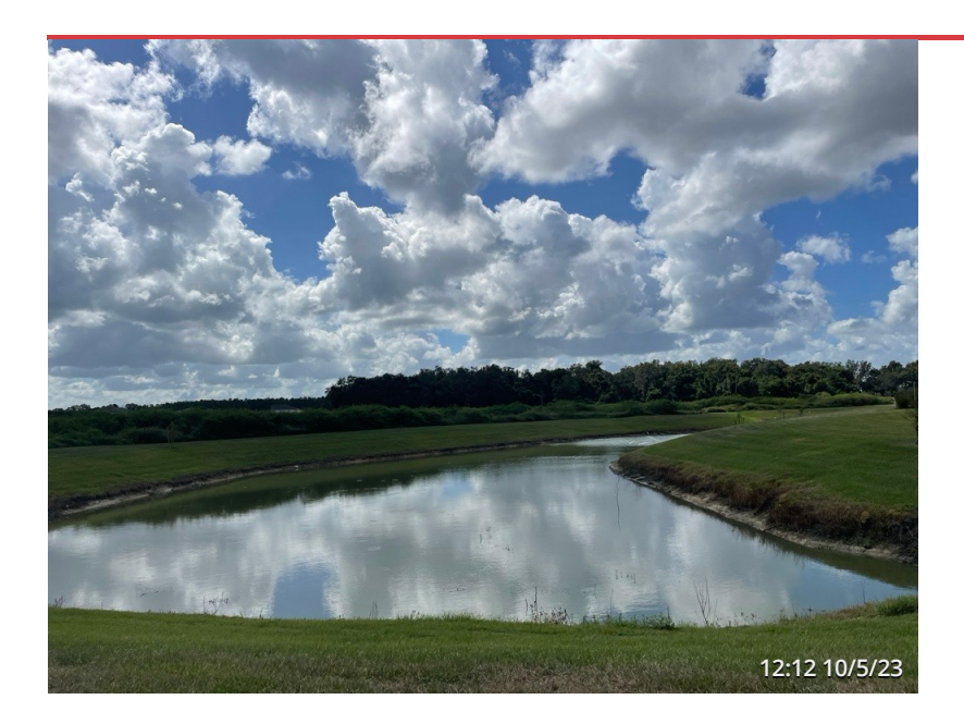
SW. 2 POND. Assigned To Horner. Looks good.